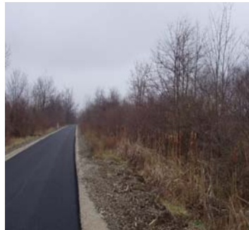
Some asphalt work near Losantville was done in 2005 before the weather turned cold.

The engineering of phases three and four of the White River Greenway (Muncie) are underway. These projects include several trail sections: from the Riverview Overlook along Bunch Boulevard south to the Craddock Wetland, from Westside Park to the west end overlook, a loop at the Heron overlook, and improvements to the existing trail at Minnetrista