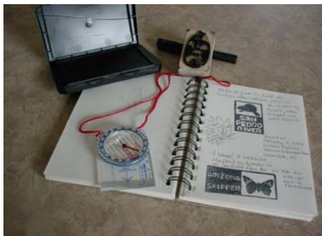
Tools of the Letterboxer