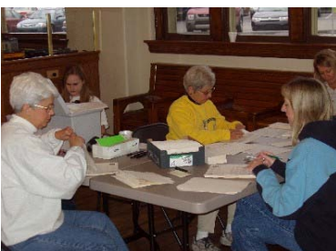
Volunteers help with annual campaign mailing

Maintenance Team members please call in if you need replacement or additional maintenance shirts. Call the Greenways' office at 765-287-0399. There is no cost to you for T-shirts.