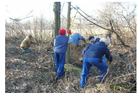
Volunteers remove a minimum amount of trees for horses and maintenance equipment passage.